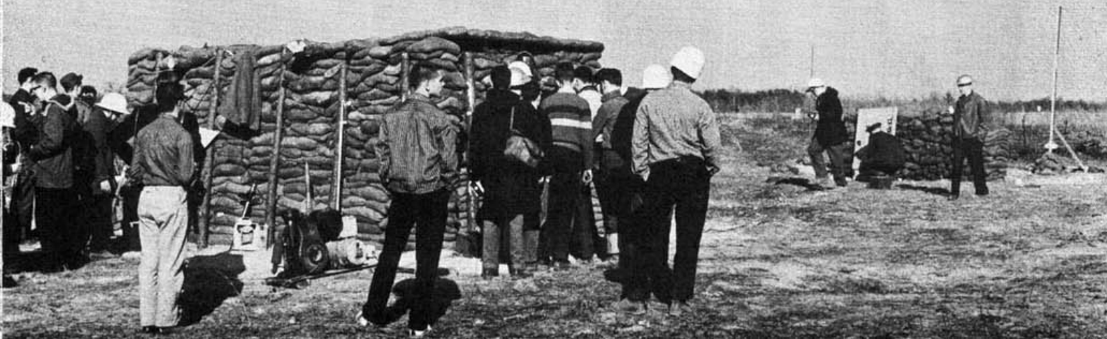
Design, construction and fueling your model missile is only half the battle! A good launch is equally important; elaborate tower (above) provides firm firing path. Remote controlled electrical firing (below) is from protected area 75' from launch pad.